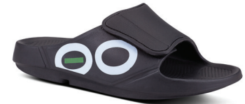
OOahh Sport Flex (Unisex)