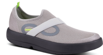
Men's OOmg Mesh