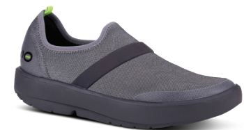
Women's OOmg Fibre